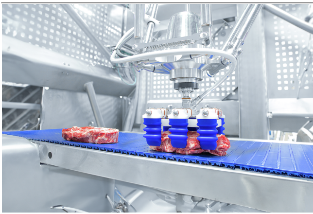
Finger gripper mGrip for handling food products