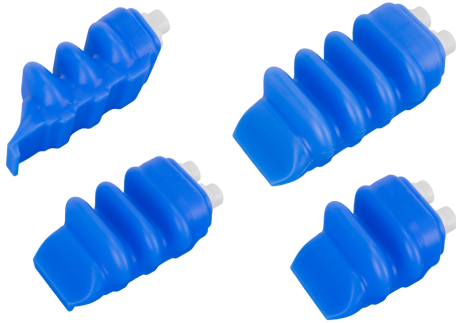
Spare Parts Finger Module Inserts FINGER-SPARE-UNIT