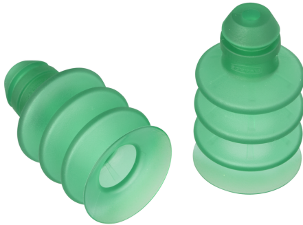
Bellows Suction Cups SPB3 P (3.5 folds)