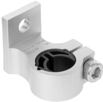
Holders for Sensors HP-SE