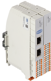
Smart Communication Module SCM