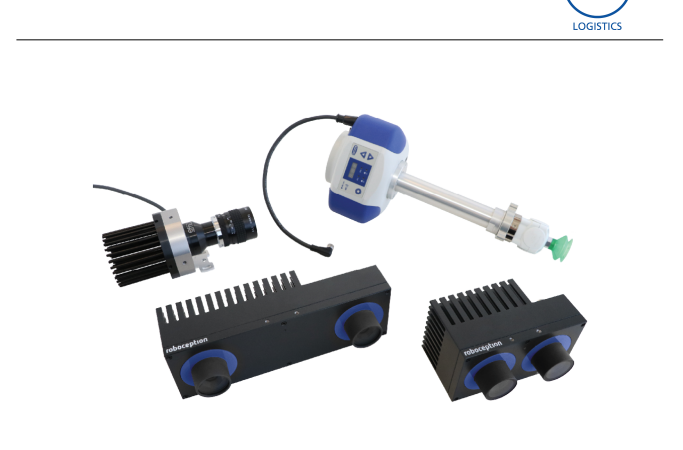
Vision & Handling Sets 3D-R

Ready-to-connect gripping system with camera