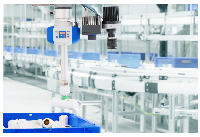
Vision & Handling Set 3D-R when handling cans

System design Vision & Handling Sets 3D-R