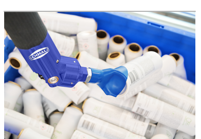
Bin-picking suction cup SVE for removing spray cans from a box \,