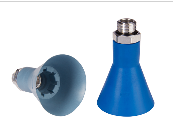
Bin-Picking Suction Cups SVE