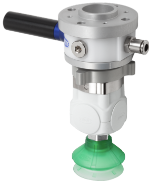
Handling Sets VEE