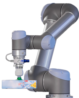
Vacuum end effector VEE when handling of small packages