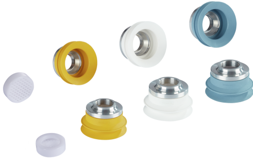
Suction Cups for Flow Grippers SCGS