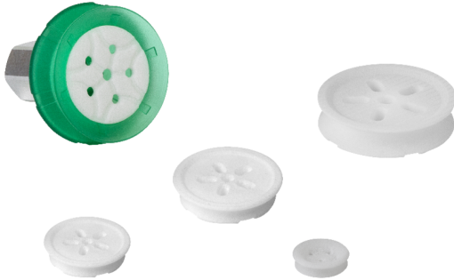
Suction Cup Inserts SPI (for SPB1)