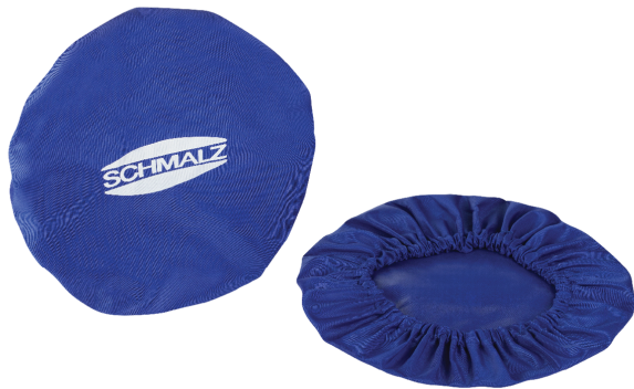
Protection Covers PC