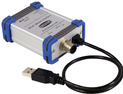
Smart Device Interface SDI