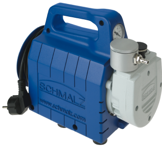
Multi-Clamp Vacuum Pump VC-M-PU