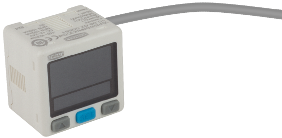
Vacuum and Pressure Switches VS-V/P-W-D-K-3C-D