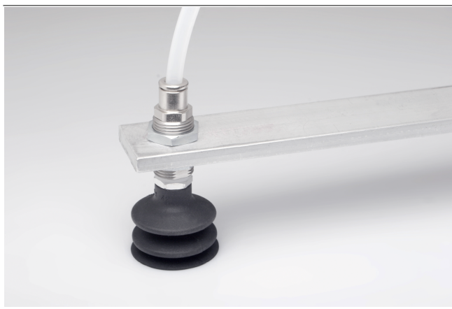
Mounting example bulkhead connectors SVS-GE