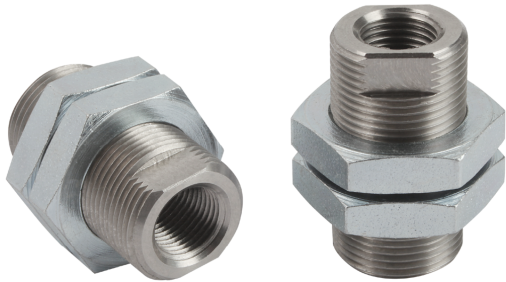
Bulkhead Connectors SVS-GE