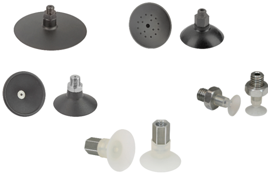
Flat Suction Cups SGPN