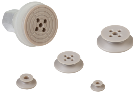
Suction Cup Inserts SPI PEEK