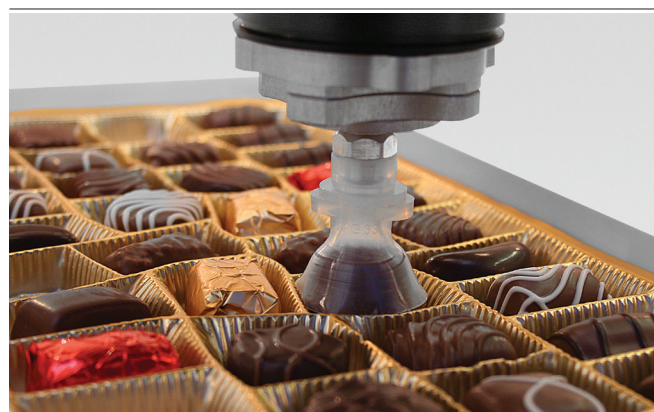
Chocolate suction cups SPG being used for handling chocolates