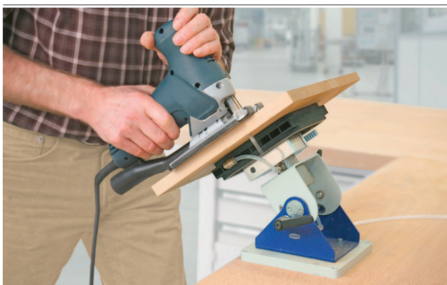
Multi-Clamp VC-M for manual processing of wooden workpieces