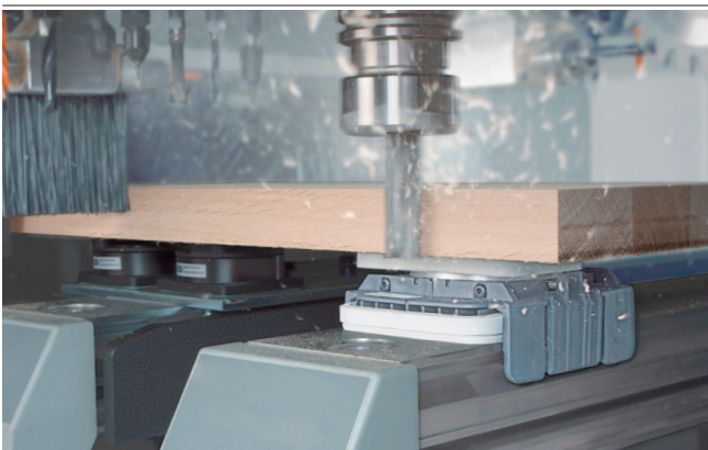
Vacuum Block VCBL-K1 being used for clamping wooden workpieces