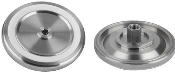
Suction Plates for High-Temperature SPL-HT